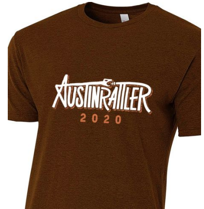
2020 Run Participant Shirt

Get your participant shirt (pictured), bib number and answers to your race-day questions. Photo ID is required. Packets must be picked up in person. They will not be given to others. *Lines will form by last name. PLEASE keep 6' distance.