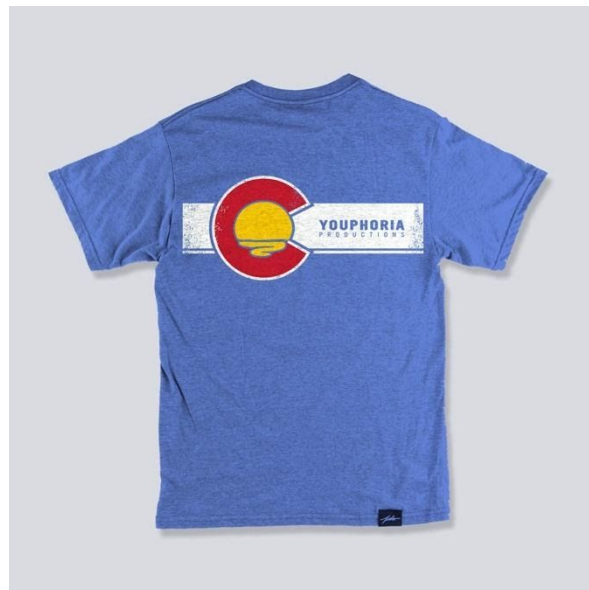
2020 Retail Shirt

Visit our retail tent throughout the weekend and check out our retail T-shirts (pictured below), water bottles, trucker hats and more.